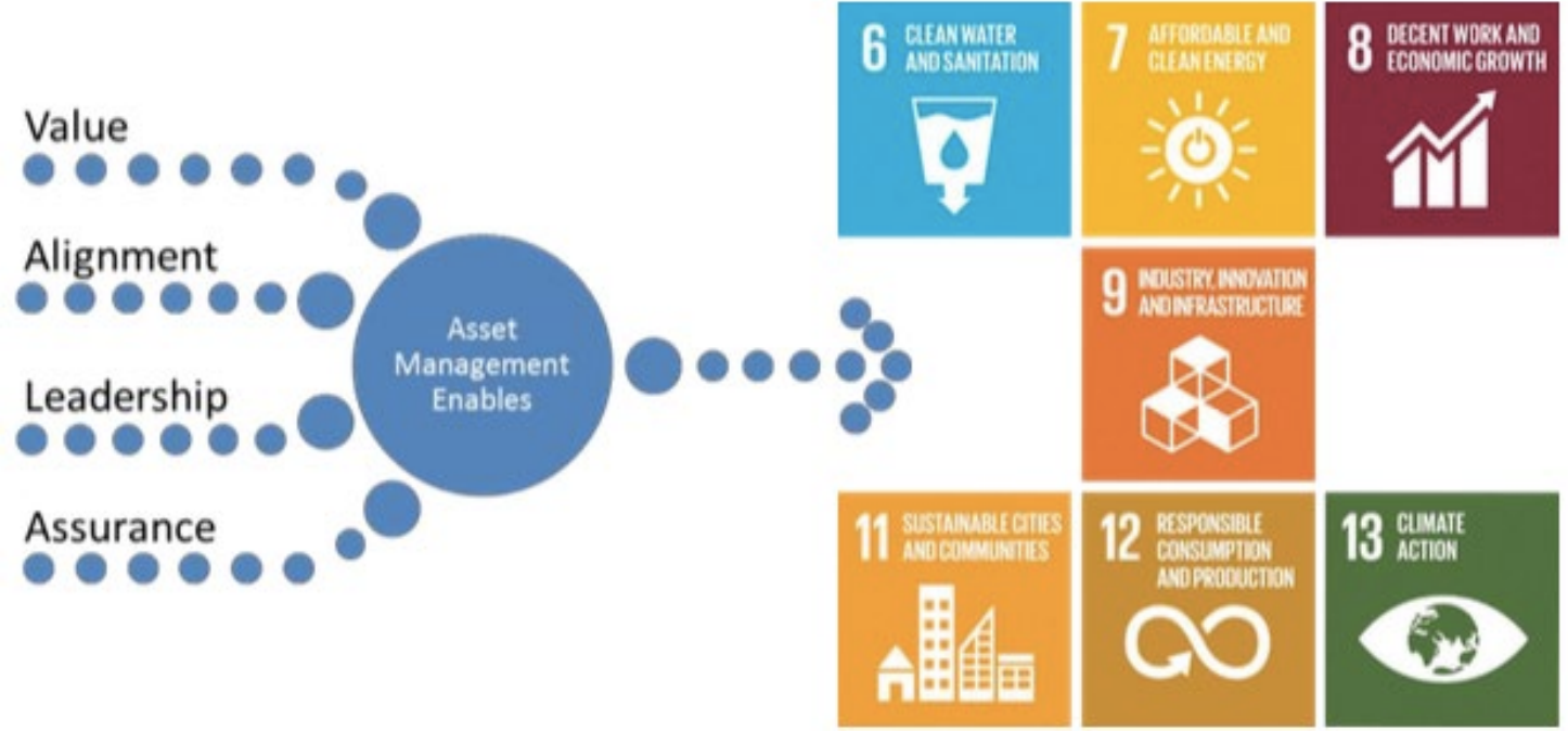
Figure 2: Asset Management enablers for success of Sustainable Development Goals.

“Good Asset Management is a key enabler for organizations seeking to contribute to the achievement of the United Nations' Sustainable Development Goals”